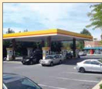
Award of Excellence – Kings Farm Shell Owner: E & C Enterprises