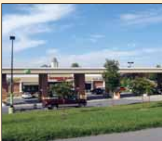
Award of Excellence – Highbridge Market BP Owner: NSR Petro Services