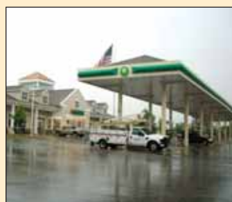
Award of Excellence – Grange Grange Hall Road BP Owner: Ranjit Hundal