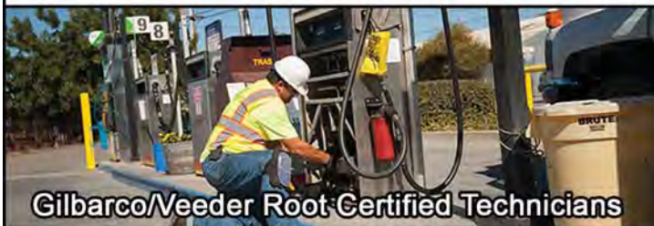
Gilbarco/Veeder Root Certified Technicians